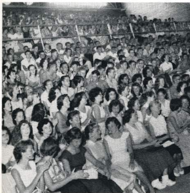
Pep rallys really give school spirit a boost.