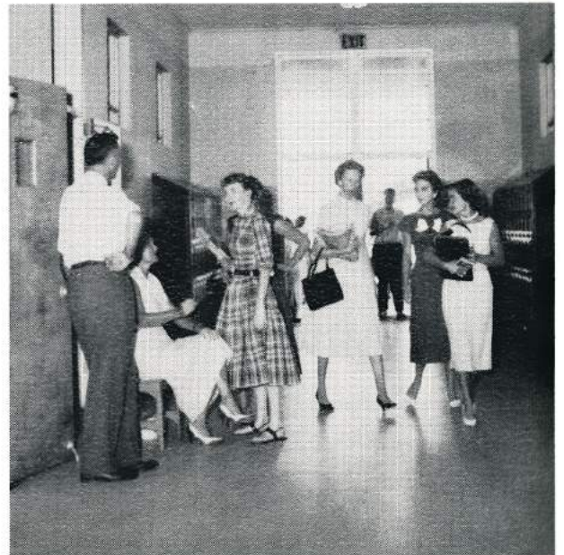
Our faculty begins the school year a week early.