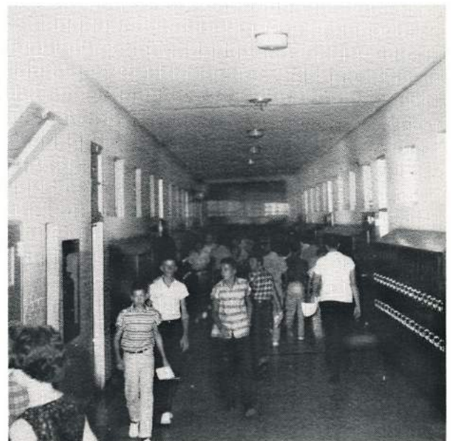
The bell rings, and in seconds the halls are packed.