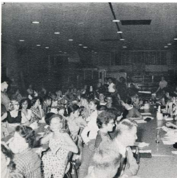
Student Council gets things started with workshop.