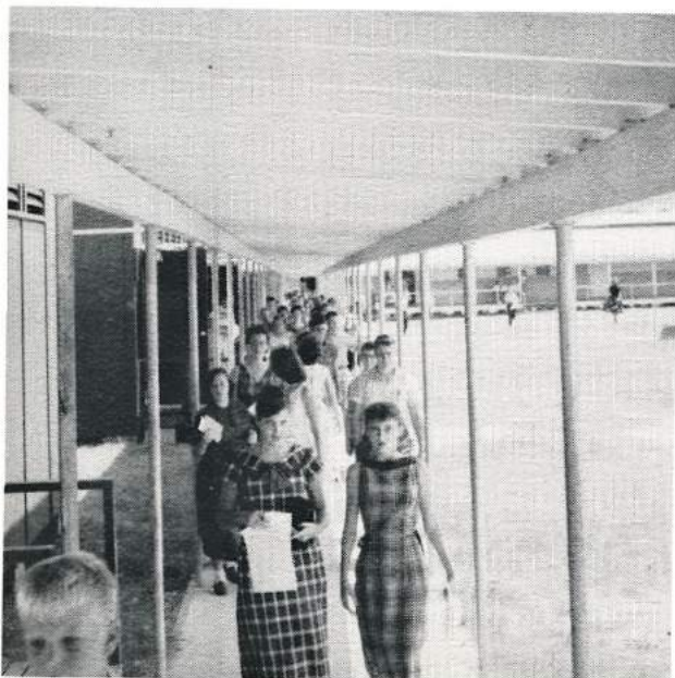
Everyone hurries to sign up for his favorite club.