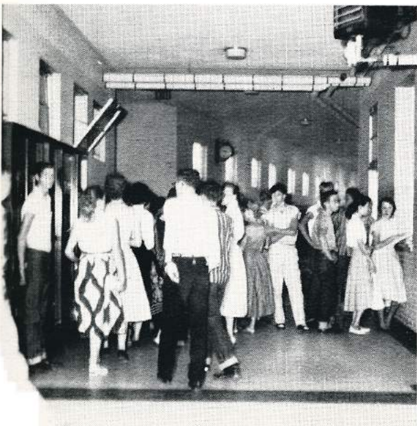
There's a mad rush for last minute schedule changes.